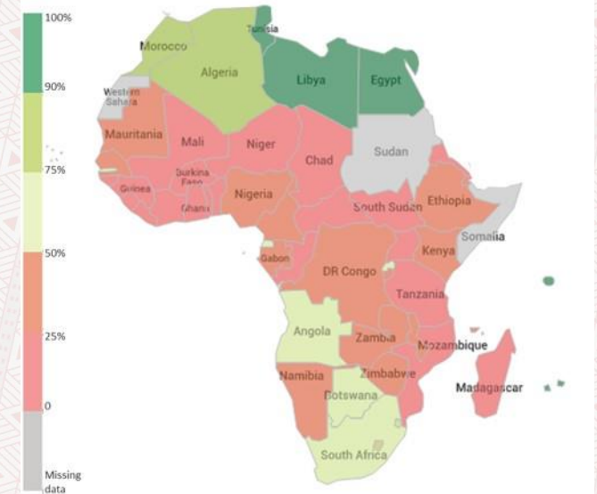
Cubic metres per capita